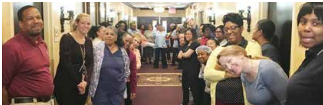
Brookside to the rescue! We all "RACE" to protect our residents.