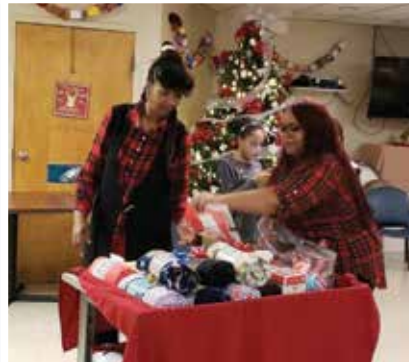
CHERYL PASSES OUT HOLIDAY GIFTS FROM DELIVERANCE EVANGELISTIC CHURCH