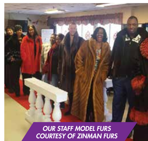
OUR STAFF MODEL FURS COURTESY OF ZINMAN FURS