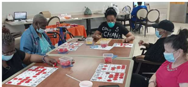
Residents playing Bingo