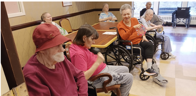
Residents playing along with our Music Therapy.