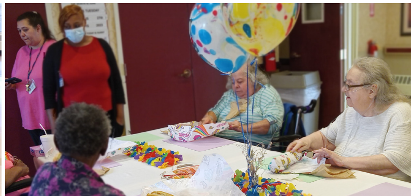
Everyone enjoying our Hoagie Fest.