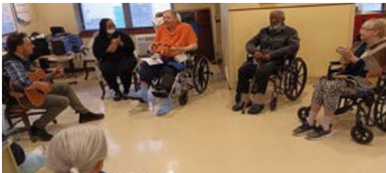
Residents enjoying Music Therapy on Liberty Lane.