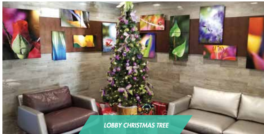
LOBBY CHRISTMAS TREE